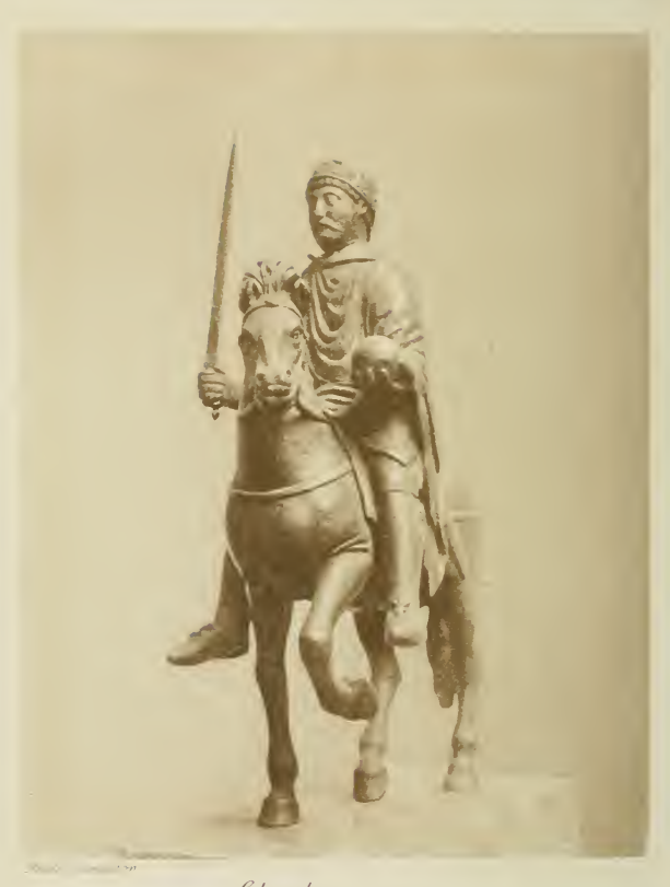
Charlemagne rom bronze statuette in the Musée Camaratet. Poris